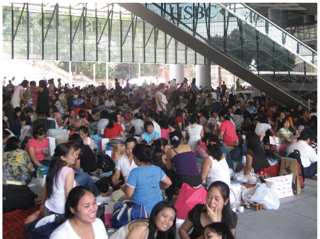
Filipino domestic workers at the basement of the HSBC, Central Hong Kong

We pass a huge group of women cleaning and coloring each other’s nails. Several women talking with their mobile phones cradled on their shoulders while manicuring their friend’s nails. Not far from the group was another group of women looking into some merchandise for sale. Selling on the street is prohibited in the area but they find a way to avoid the police. A man and several women seated on a blanket on a pavement were playing cards and laughing