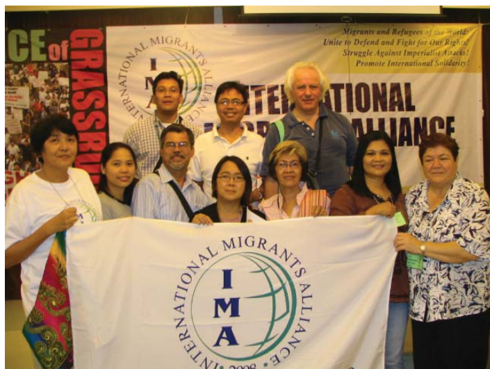
Australian Delegation to IMA