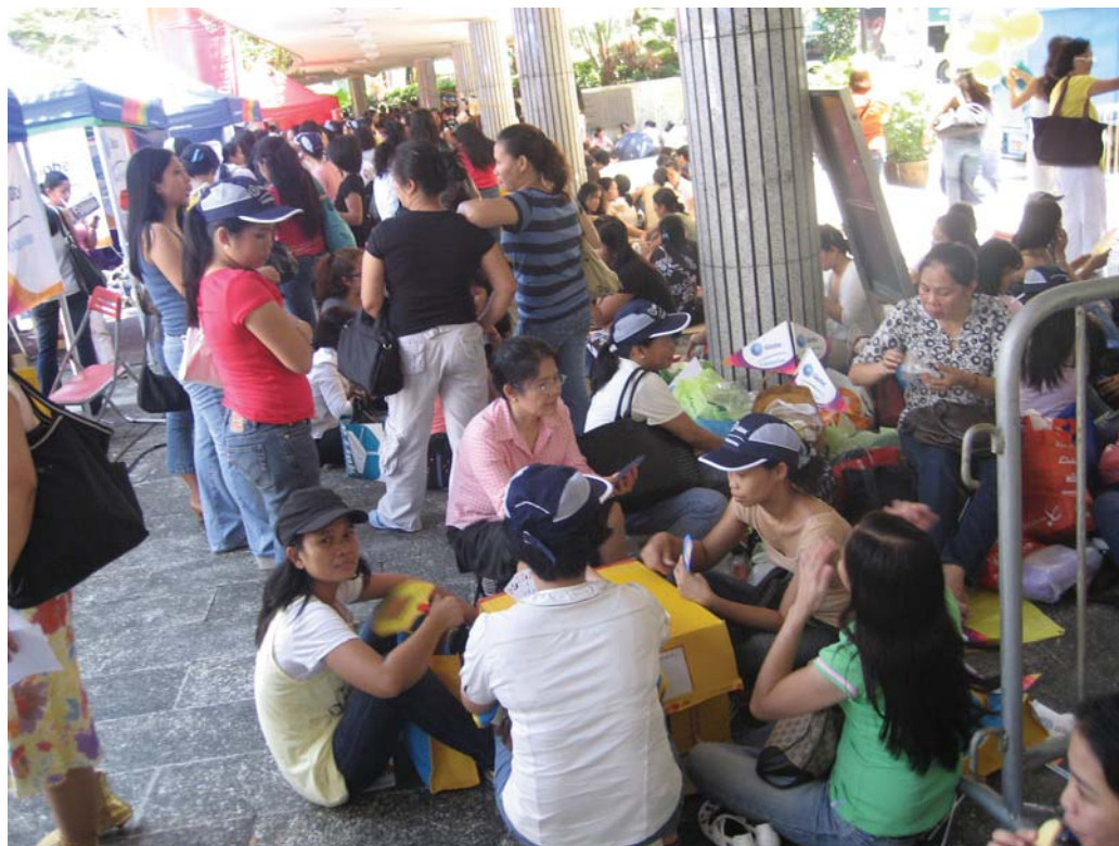
Filipino domestic workers at the side of the Chater Garden, Hong Kong

their lungs out. A woman was proudly showing to friends a picture of her daughter receiving a medal at the school back home in the Philippines. She said sadly that her 'amo' did not allow her to go home to her daughter's graduation. Still another woman, bleary-eyed was speaking on her cell phone having a lover's spat with her husband whom she has not seen for months.