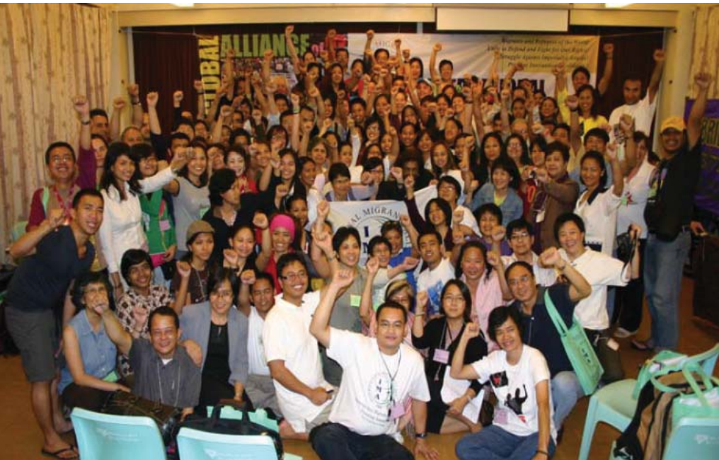
Delegates to International Migrant Alliance (IMA) Founding Assembly, June 2008, Hong Kong

“For a long time, others spoke on our behalf. Now we speak for ourselves.”